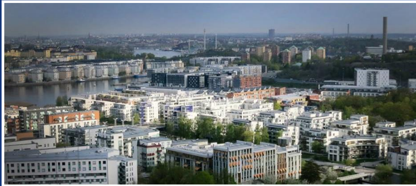
Hammarby Sjöstad, Stockholm