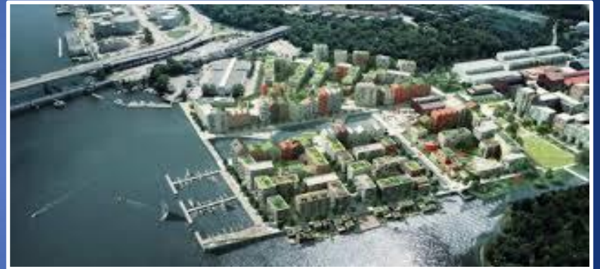
Royal Sea Port, Stockholm