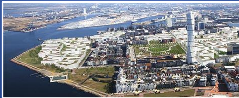
Western Harbour, Mamö